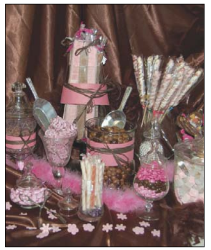
This imaginative idea is simple and inexpensive, and best of all it will please young and old alike.