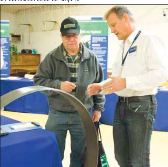
Above: An example of the diameter of a pipeline

that year in Quebec. Energy East would take shipments of crude oil from two points in Western Canada—Hardisty, Alta. and Moosomin—and ship it to the Eastern refineries that currently rely on imported oil, and to an export position at St. John, New Brunswick. Western Canadian crude currently sells at a significant discount to the world price because of the lack of export options.