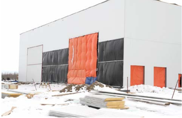
The 400 feet by 100 feet expansion being added to the Seed Hawk facilities will be finished in May