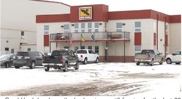
Seed Hawk has been the leaders in zero-till farming for the last 20 years. Above: the Seed Hawk headquarters located in Langbank.

warehouse parts and have been forced to store some parts outside. "One of the issues we have is that we have to get all of these things inside. We are growing so quickly that we've run out of rooms indoors." Clarke says A 400 feet by 100 feet expansion is under construction and will be attached to the current production facility.