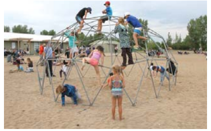
Kids playing on the beach before the fireworks.